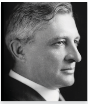
We weren't born yesterday.

With more than a century of innovation and industry experience in home comfort, Carrier has engineered a smart thermostat that truly lives up to the name. Offering convenience, efficiency, peace of mind and powerful comfort control, the Infinity<sup>®</sup> Touch Control thermostat stands as one more reason to turn to the experts.